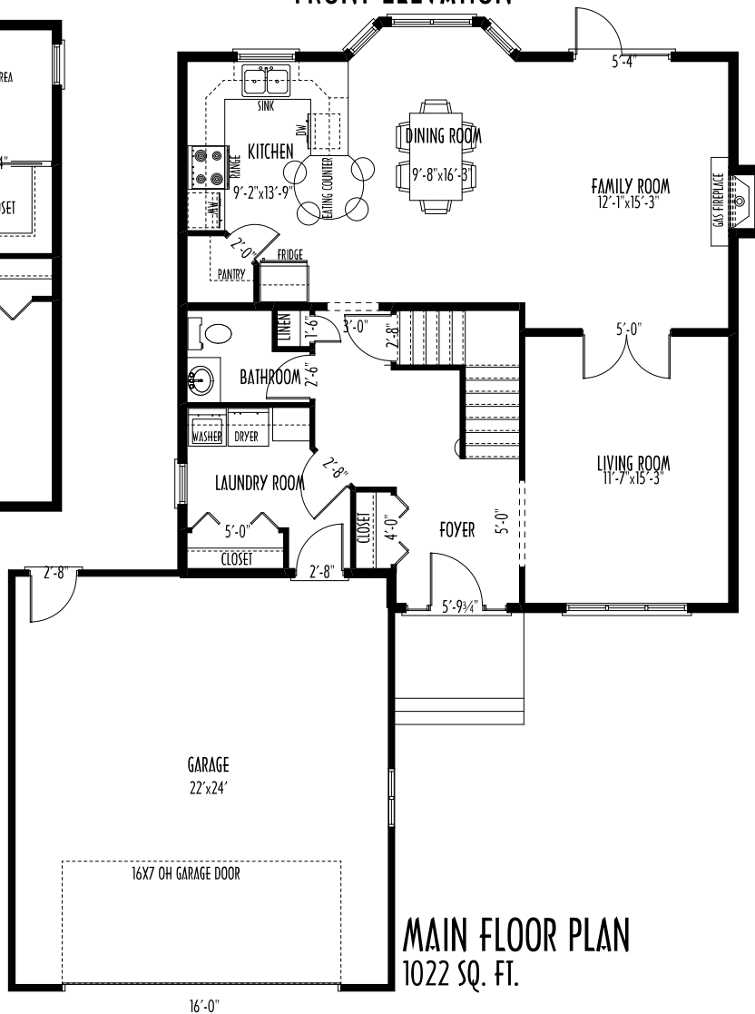
MAIN FLOOR PLAN 1022 SQ. FT.